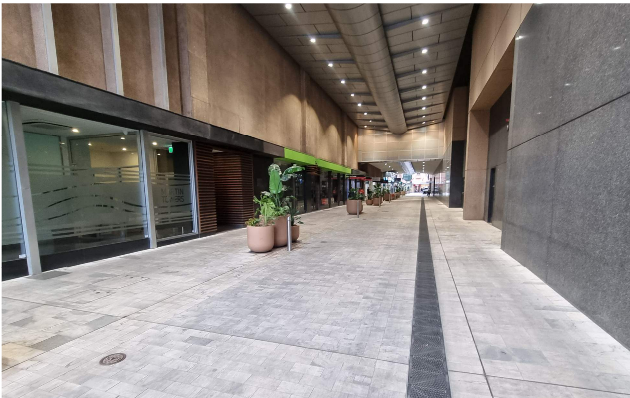
Charles Street – view from north