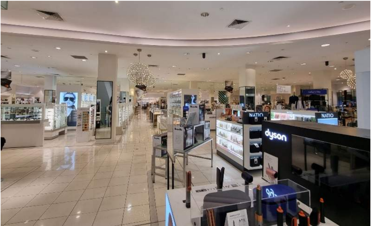
David Jones' retail sales areas – view from south