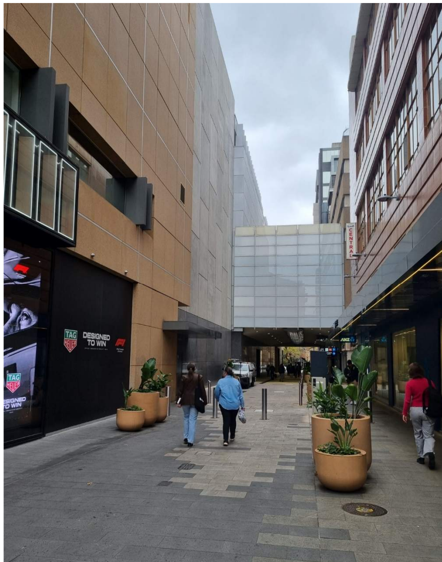
Charles Street – view from north