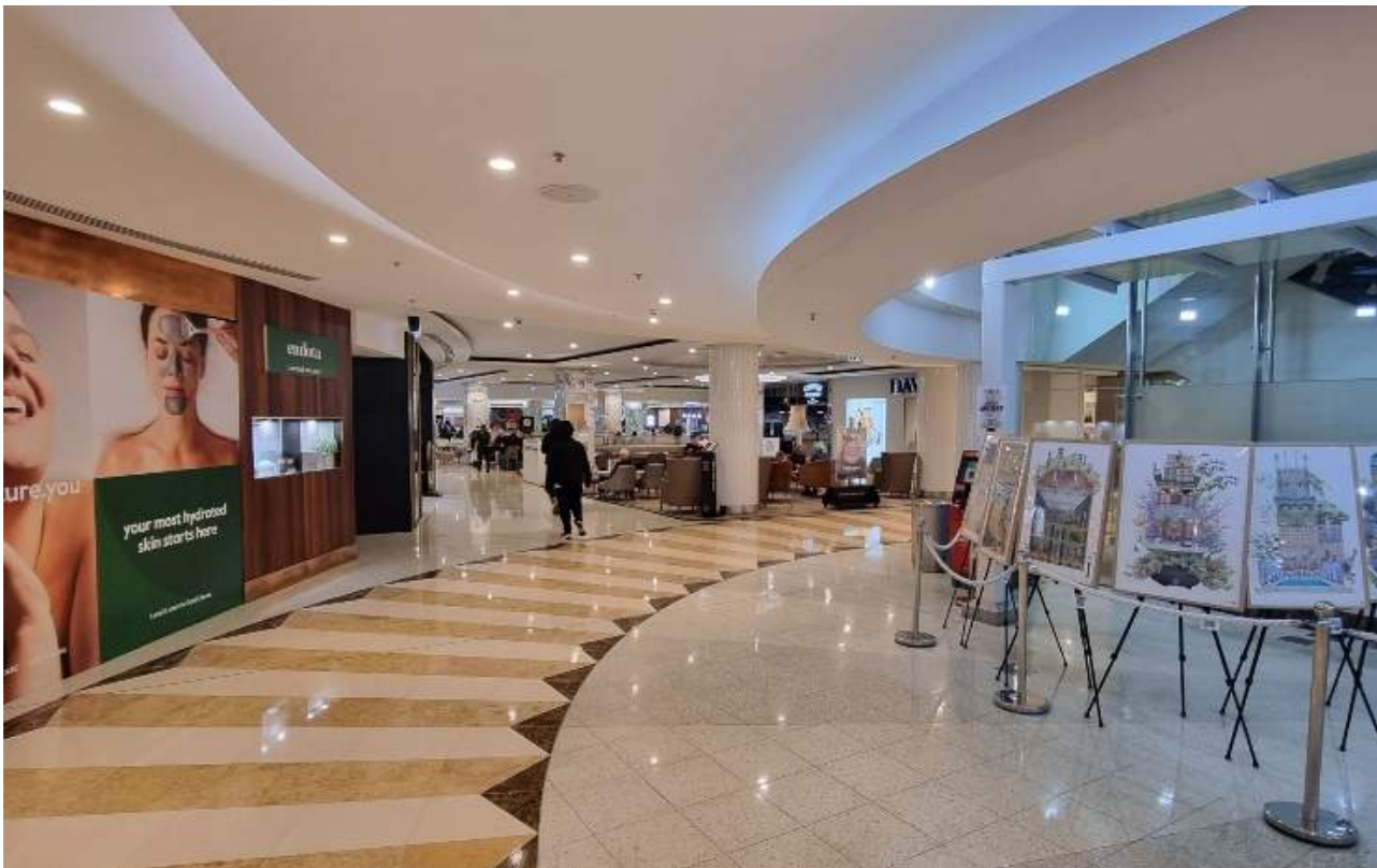
Adelaide Central Food Court – view from south