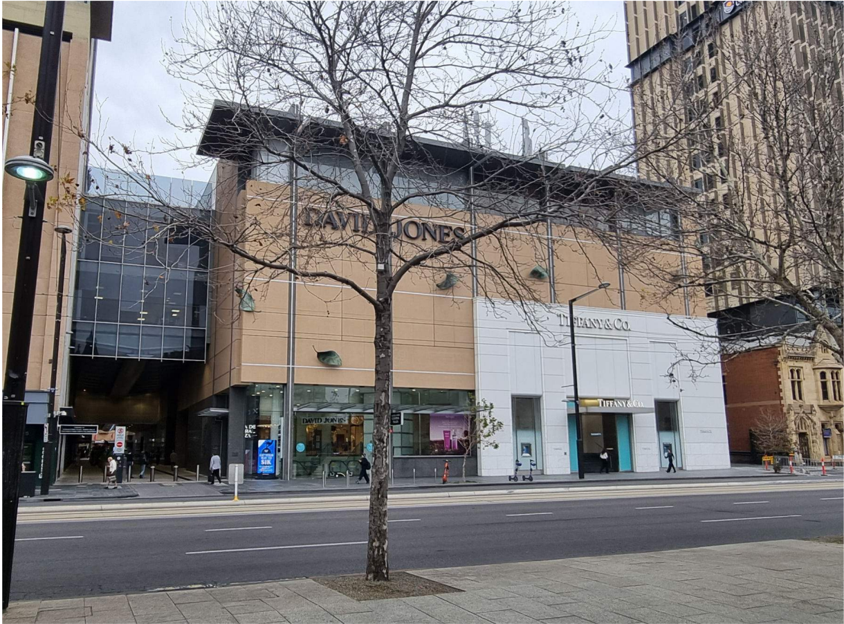
Subject Land – view from north