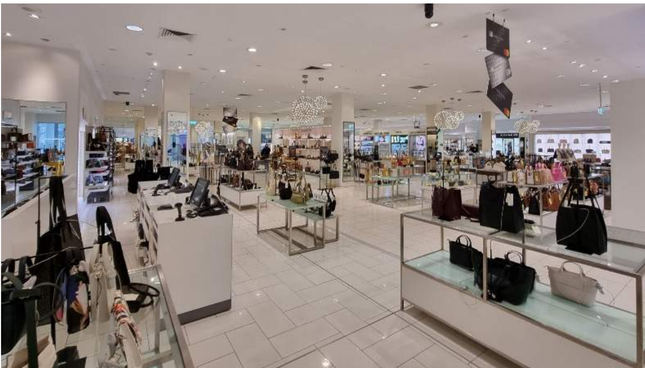
David Jones' retail sales areas – view from north