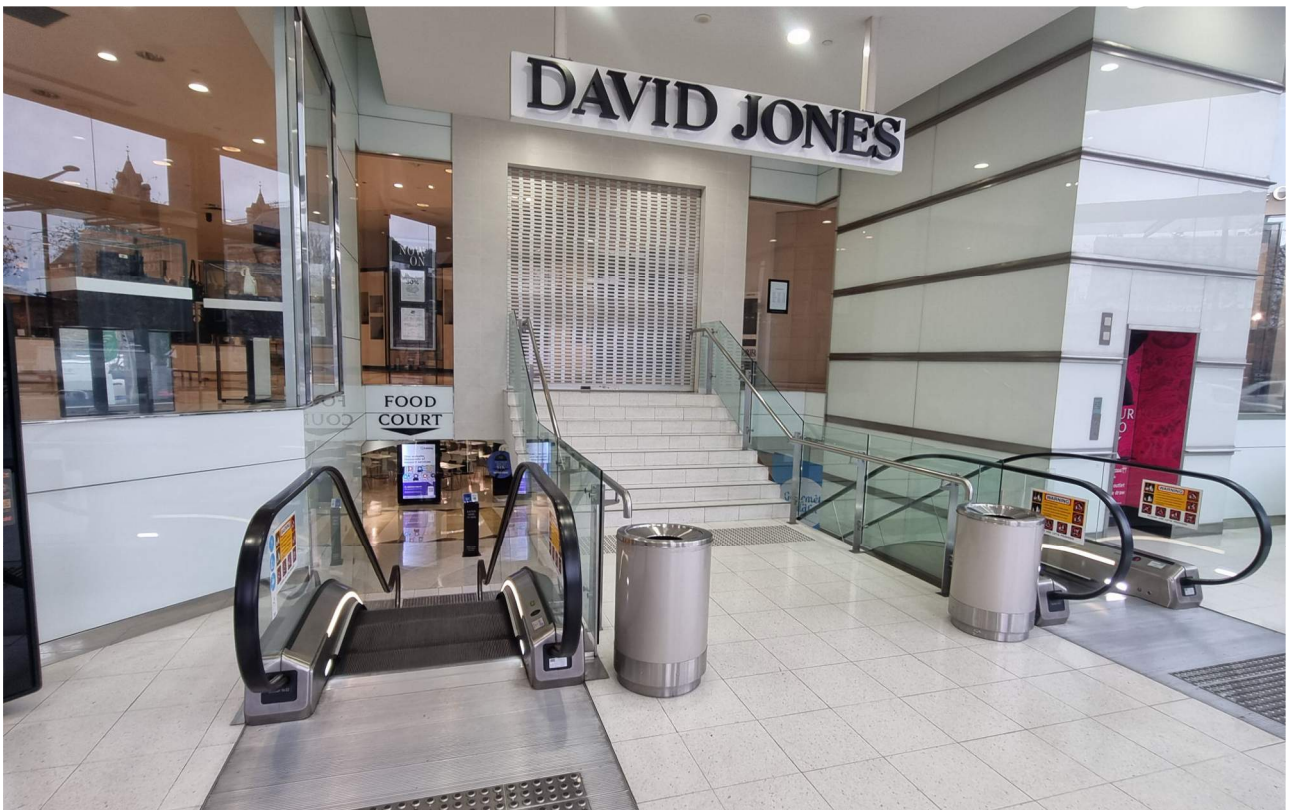
Pedestrian entry to building interior (from North Terrace) – view from north