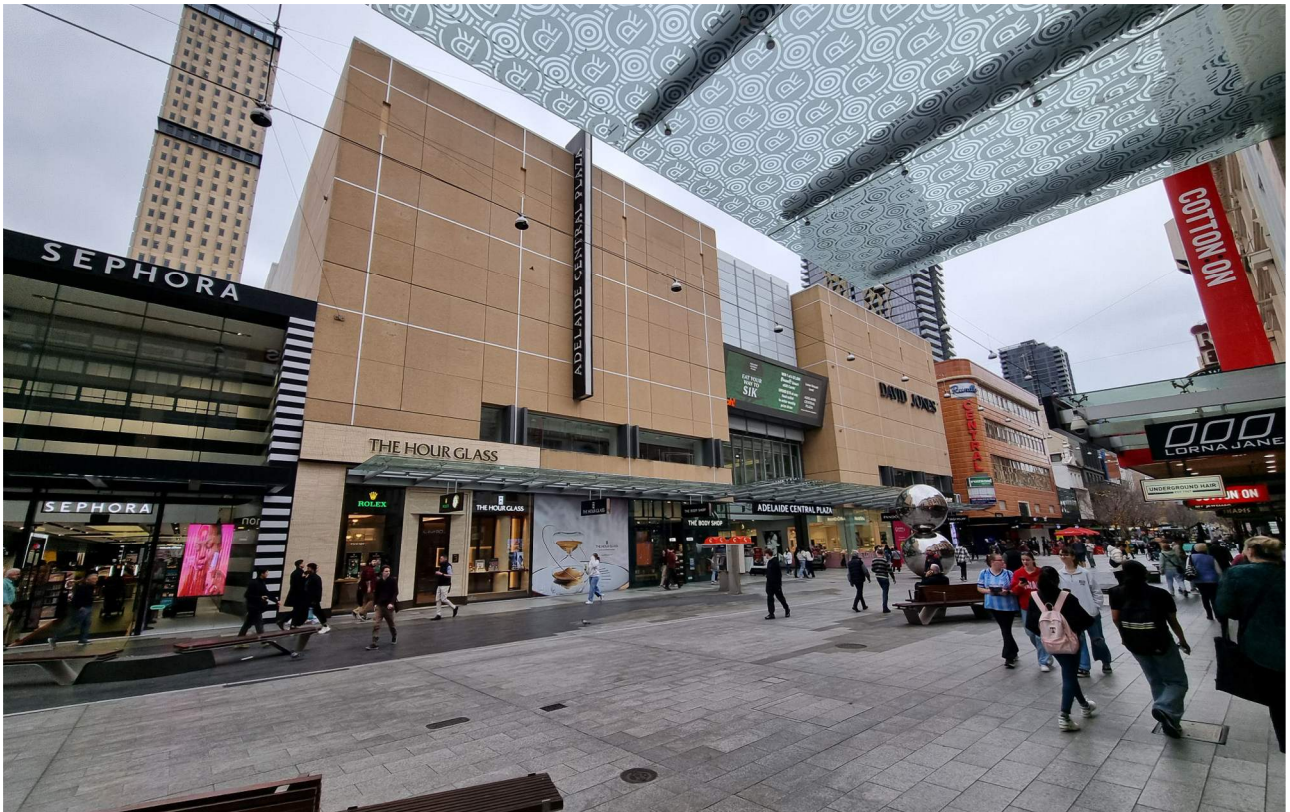
Southern portion of subject land – view from south