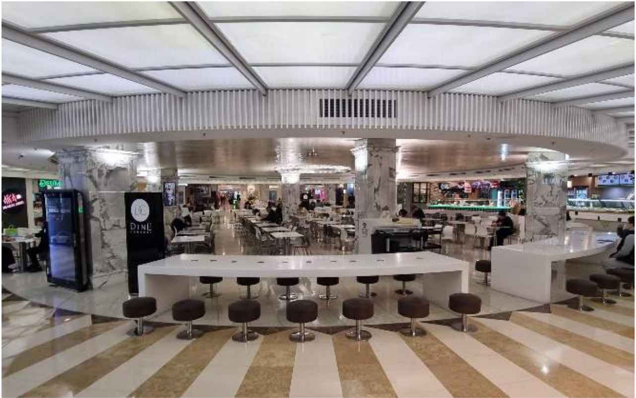
Adelaide Central Food Court – view from north