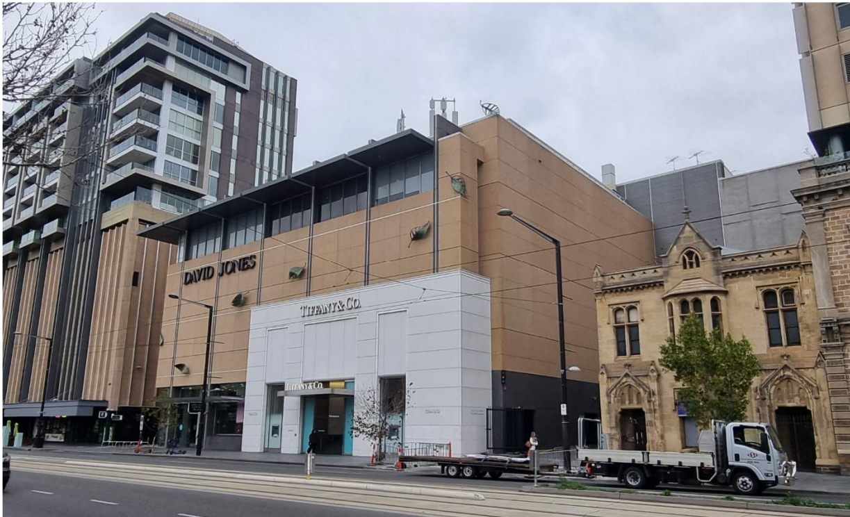
Subject Land – view from northwest